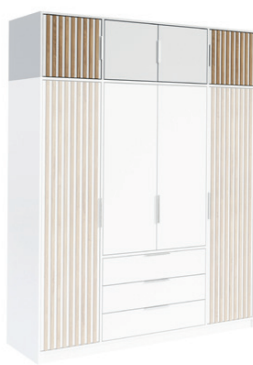
frame: white front: lamella, white, mirror