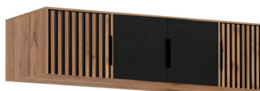
BALI LUX D4 extension width 196 | depth 57,5 | height 45 cm