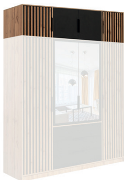
frame: Wotan oak front: lamella, black, mirror