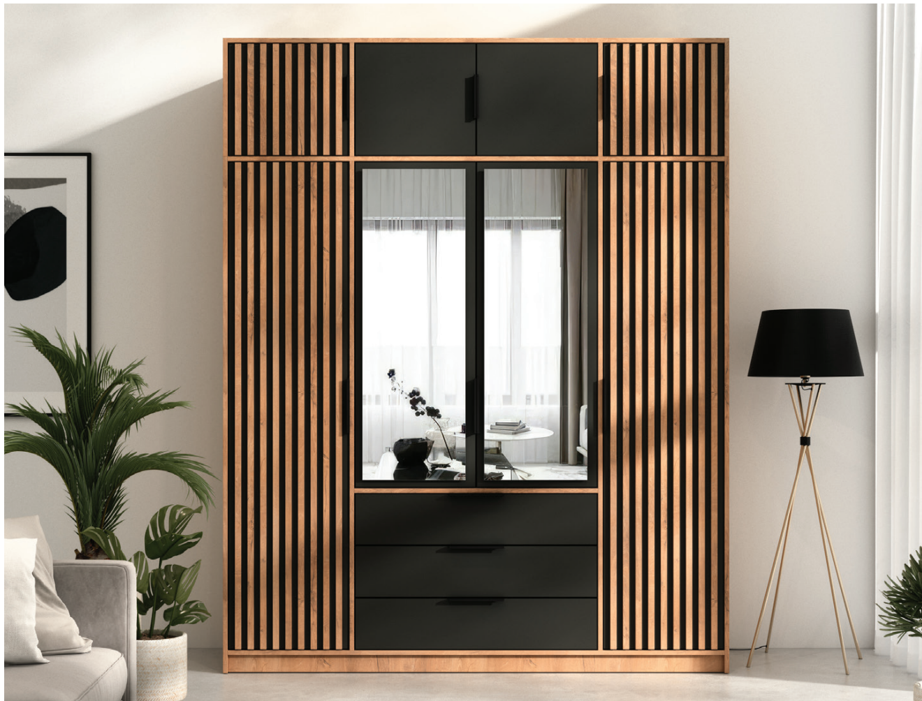
In the picture: frame -Wotan oak; front - lamella, black, mirror. Hinged door.