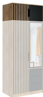
frame: Wotan oak front: lamella, black, mirror