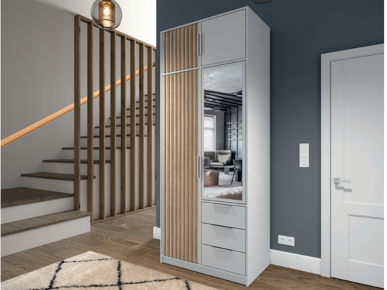
In the picture: frame -white; front - lamella, white, mirror. Hinged door.