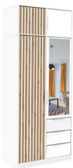
frame: white front: lamella, white, mirror