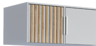
BALI LUX D2 extension width 100 | depth 57,5 | height 45 cm