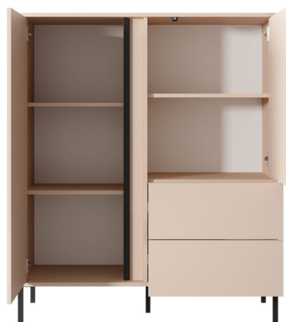
A - high commode 2d2s - W 103,3 / H 123,4 / D 39,5 cm