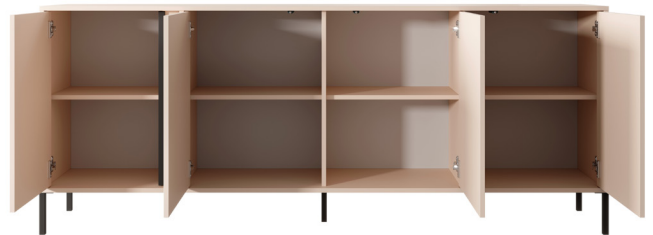
E - commode 203 4d - W 202,9 / H 81,4 / D 39,5 cm