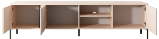
F - rtv table 203 - W 202,9 / H 53,4 / D 39,5 cm