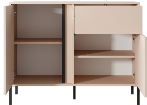
D - commode 103 2d1s - W 103,3 / H 81,4 / D 39,5 cm