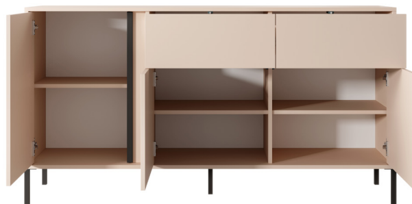
B - commode 153 3d2s - W 153,1 / H 81,4 / D 39,5 cm