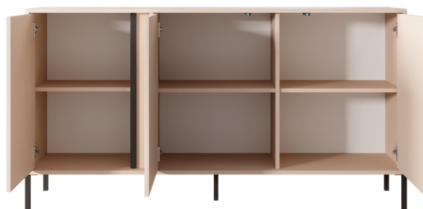
C - commode 153 3d - W 153,1 / H 81,4 / D 39,5 cm