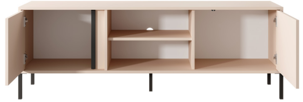
G - rtv table 153 - W 153,1 / H 53,4 / D 39,5 cm